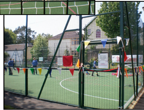
Multi-use games area